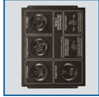
Length - 10" x Height - 8" x Depth - 4"

Panel Includes: Run light, engine hourmeter, start/stop, and shutdown bypass/preheat switch.