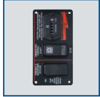
Length - 5.5" x Height - 2.88"