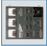
Length - 14" x Height - 17" x Depth - 6.25"

Panel Includes: DC voltmeter, water temperature gauge, oil pressure gauge, engine hourmeter, start/stop, and shutdown bypass/preheat switch. Available with enclosure.