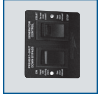
Length - 3.38" x Height - 2.88"

Choose the amount of control you need, and the flexibility you want. Northern Lights offers several control panels for models up to 30kW, each available in 12 or 24 volt. These handsome panels allow you to monitor and control your generator from one or several locations on board. Custom panels available.