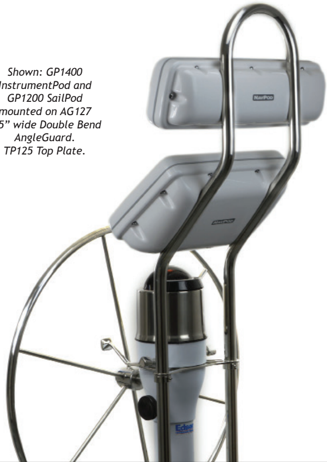
Shown: GP1400 InstrumentPod and GP1200 SailPod mounted on AG127 9.5" wide Double Bend AngleGuard. TP125 Top Plate.