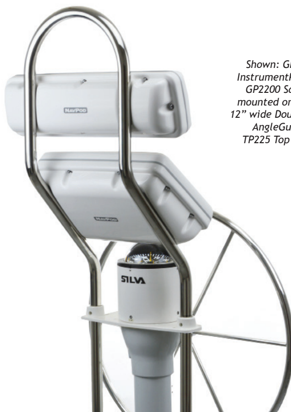
Shown: GP2400 InstrumentPod and GP2200 SailPod mounted on AG227 12" wide Double Bend AngleGuard. TP225 Top Plate.