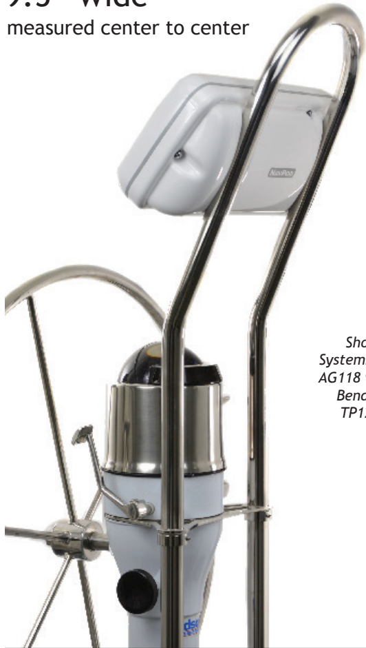
Shown: GP1500 SystemPod mounted on AG118 9.5" wide Single Bend AngleGuard. TP125 Top Plate.