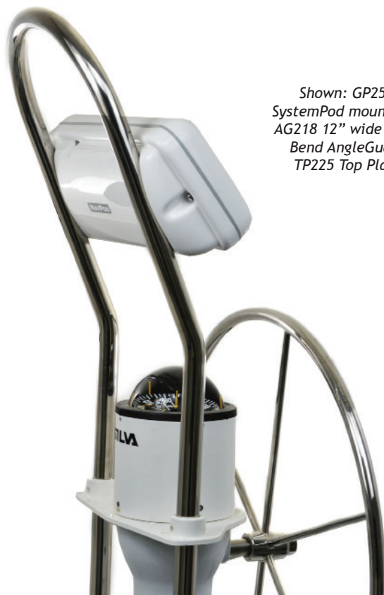
Shown: GP2500 SystemPod mounted on AG218 12" wide Single Bend AngleGuard. TP225 Top Plate.