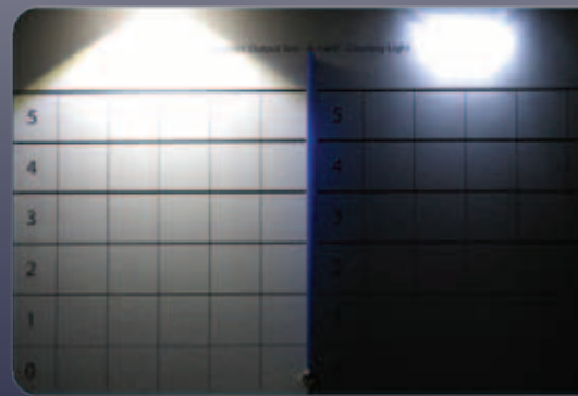
NO Photo Retouching

Lumitec Lighting 561.272.9840 www.lumiteclighting.com