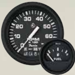
Euro - page 13