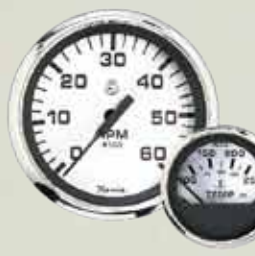
Spun Silver - page 17