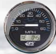
GPS Speedometer - page 6