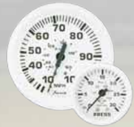
Dress White - page 12