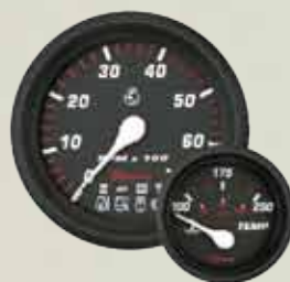
Professional Red - page 16