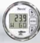
Depth Sounders - page 5