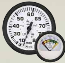
Euro White - page 14