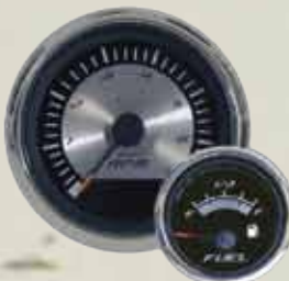
Platinum - page 16