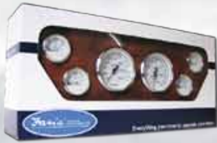
Boxed Sets - page 3