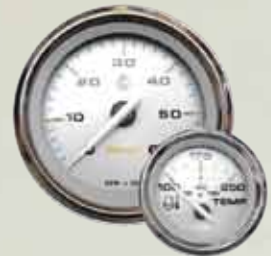
Kronos - page 15