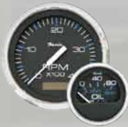
Chesapeake Black SS - page 9