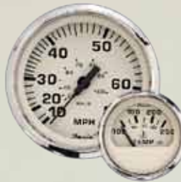
Euro Biege SS - page 15