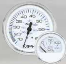
Chesapeake White SS - page 10