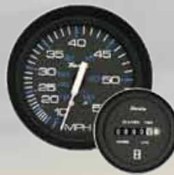
Coral - page 11