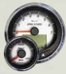
Digital Black Fade - page 18