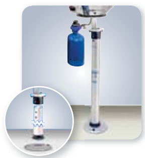
Double Locking "Stowable" Pedestal Mount 28 in. (71 cm) A10-184 Use with any Magma Marine Kettle Grill