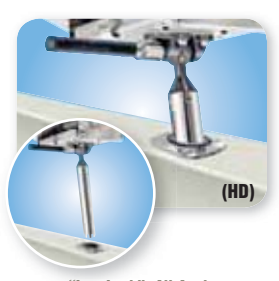
"LeveLock": All-Angle Fish-Rod Holder Mount T10-355 Fits all rect. grills & "SM" tables Fits standard fish rod holders