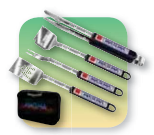
"Telescoping" Stainless Grill Tools with Storage Case A10-132T 5 Piece Set