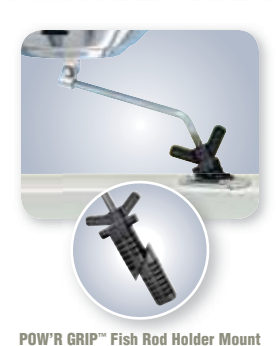
A10-175 Fits standard fish rod holders Use with any Magma Marine Kettle Grill