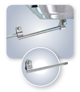
Mounting Extension A10-140 Adds 8" ( 20 cm) Use with any Magma Marine Kettle Grill