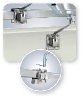
Side (Bulkhead) or Square/Flat Rail Mount A10-240 Use with any Magma Marine Kettle Grill See website for application details