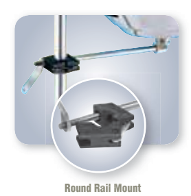
A10-080 Standard Rails 7/8" or 1" (22 mm or 25.5 mm) A10-085 Oversize Rails 1-1/8" or 1-1/4" (28.5 mm or 32 mm) A10-090 Large Rails 1-1/2" (38 mm) Use with any Magma Marine Kettle Grill