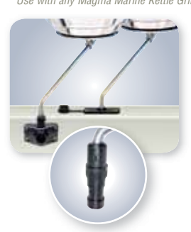
Socket Type Rod Holder Mount A10-165 Fits Scotty®/Striker Grip Rod Holder Sockets Use with any Magma Marine Kettle Grill Rod holder sockets not included