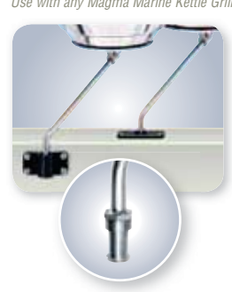
Socket Type Rod Holder Mount A10-160 Fits Tempress Fish-On® & Roberts Rod Holder Sockets Use with any Magma Marine Kettle Grill Rod holder sockets not included