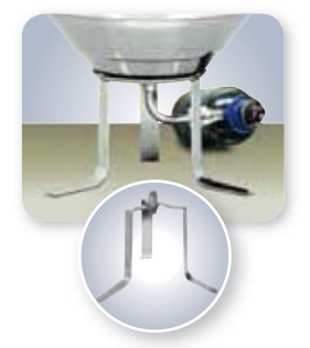
Folding Shore Stand/Table Top Legs A10-650