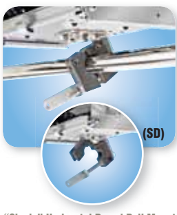
"Single" Horizontal Round Rail Mount

Fits 12" x 18" or smaller rect, grills & "SM" Tables Rod holder sockets not included.