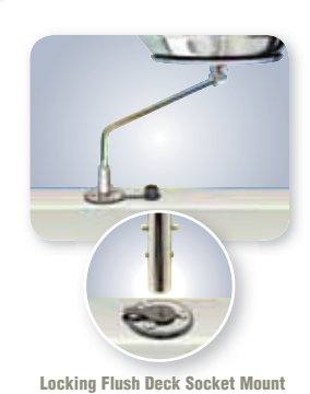
A10-126 Use with any Magma Marine Kettle Grill