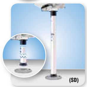
28 in. (71 cm) Double Locking Stowable Pedestal Mount T10-185 Fits all rect. grills & "SM" tables