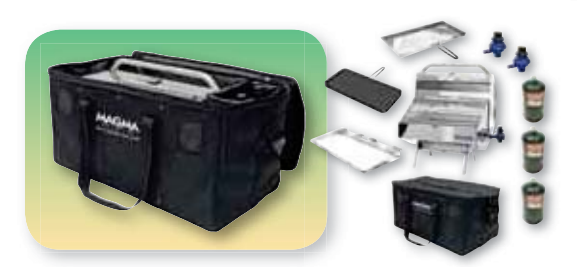
Luggage Quality Padded Grill & Accessory Carrying/Storage Cases for Rectangular Grills

Fits 9" x 18" Grills (23 cm x 46 cm) A10-1292 Fits 12" x 18" Grills (30 cm x 46 cm) A10-1293 Fits 12" x 24" Grills (30 cm x 61 cm)