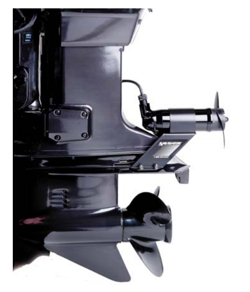
Cavitation bracket hole dim.

65-5201 - Saltwater version has stainless steel hardware for saltwater protection.